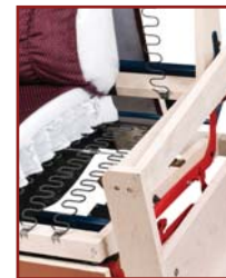
508 M shown

Each luxury lift & recline chair is hand crafted in our facility using decades of motion furniture experience.