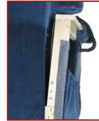
501 M shown

Sizes may vary depending on fabric, filling material, upholstery and carpet thickness. All measurements taken on concrete floor using levels and metal rulers.